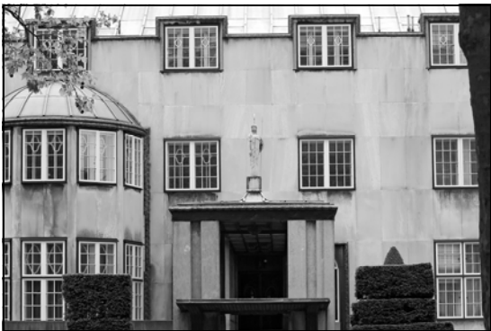
Stoclet Palace façade detail

The Stoclet Palace in Brussels has been added to UNESCO's roster of World Heritage Sites. The building was designed in 1905 by Austrian architect Josef Hoffmann for banker and collector Adolphe Stoclet. It is considered an icon of the Viennese Secessionist Movement and an important milestone in the history of European architecture. UNESCO states that "...[its] austere geometry marked a turning point in Art Nouveau, foreshadowing Art Deco and the Modern Movement in architecture."