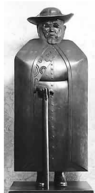
Bronze statue of Father Damien by Marisol Escobar in the U.S. Capitol

Born Joseph de Veuster, in 1840 in Tremelo, Belgium, he entered the Congregation of the Sacred Hearts in 1859 and was ordained a priest in Honolulu. He worked on the Big Island for nine years and then spent sixteen years on Molokai, ultimately succumbing to leprosy (now called Hansen’s disease) in 1889.