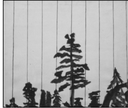
Luc Tuymans Schwarzheide , 1986 oil on canvas 23 5/8" x 27 1/2" Private collection © Luc Tuymans

Luc Tuymans is considered one of the most accomplished and influential painters working in the world today. Born (1958) and raised in Antwerp, where he lives and works, Tuymans draws on the vast heritage of the Northern European painting. At the same time, as a child of the 1950s and 1960s, he is deeply interested in and understandably influenced by photography, television and cinema. Also interested in the lingering effects of World War II on the lives of Europeans, he frequently explores issues of history and memory.