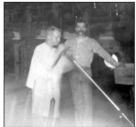
Detail of faded photo of Belgian glass workers blowing window glass in the Dunkirk factory